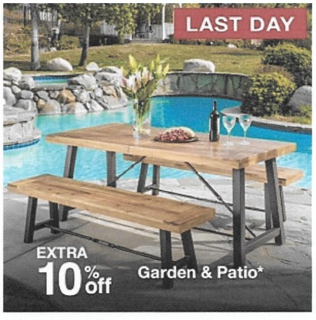
Ends 7/27 Shop Now