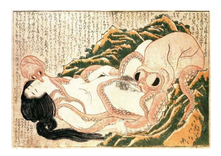
Katsushika Hokusai's The Dream of the Fisherman's Wife