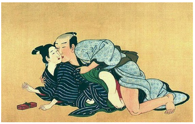
Miyagawa Isshō's Spring Pastimes Series