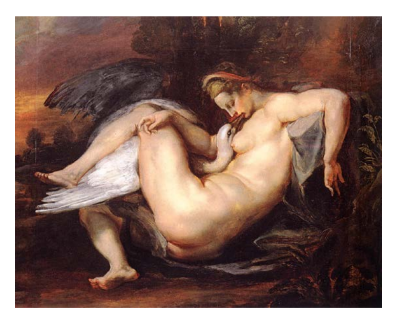
Michelangelo's Leda and the Swan (copy)